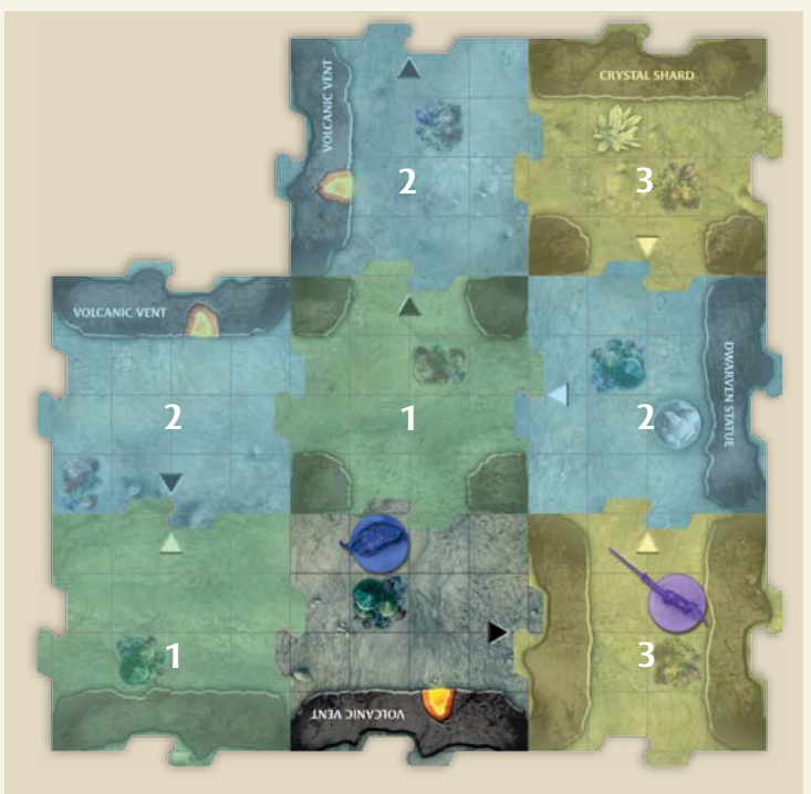
When counting tiles, you do not count diagonally and you count around tiles. The Drow Duelist, for example, is 3 tiles away from Drizzt.