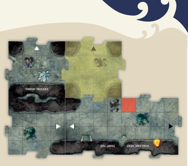
A tile is a component of the game board, highlighted in yellow. A square is a part of a tile, highlighted in red. The Start tile is a special tile: it is treated as two tiles.

You draw from the collected Cavern tiles (referred to as the Cavern Tile stack) to build the network of tunnels representing the Underdark. There are endless caverns in the Underdark, and it is easy to get lost. Each time you play, the caves have a different layout.