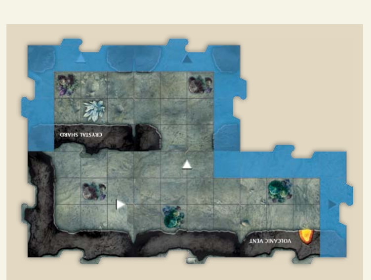
An unexplored edge is an edge of a tile without a wall that is not adjacent to another tile. There are 6 unexplored edges in this diagram, highlighted in blue.

Each Cavern tile features a mushroom patch (the square where Monsters are placed) and a white or black triangle (used to distinguish between less dangerous and more dangerous tiles). Many tiles have walls, a few tiles have other special features, and some tiles have names to distinguish them for use in certain adventures.